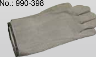
Protection gloves Art.-No.: 990-398